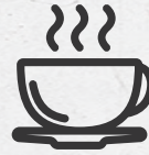
Communal break out facilities