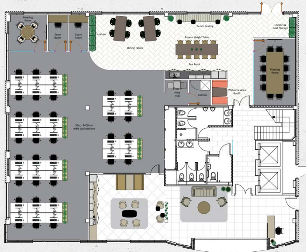
Example space plans