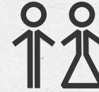
Dedicated shower and changing facilities